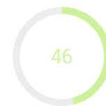
Your Business Excellence Indicator

Adapting to the current world requires agility. The workshop and keynote series represents an accumulation of many years and multiple companies and experiences. They are a combination of proven tools and techniques to help companies not only survive but thrive in these